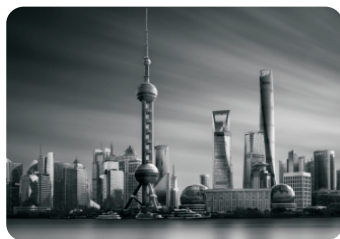
ILLUSTRATION / DIGITAL ART